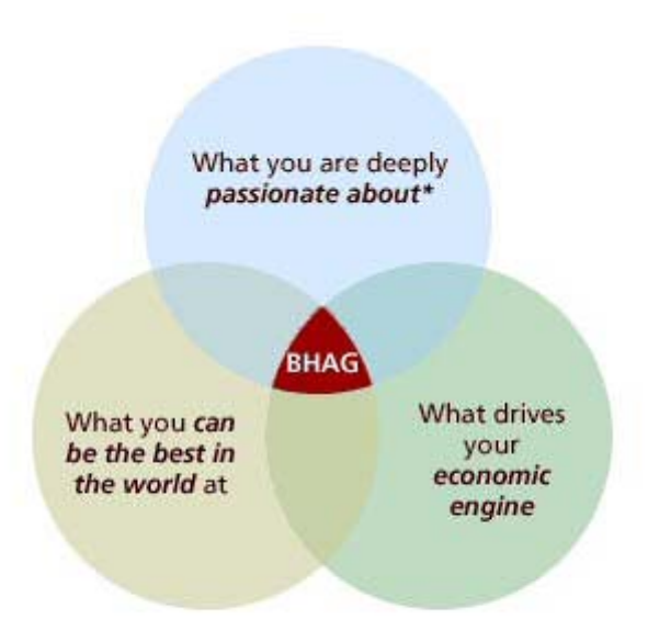
*Includes your core values and purpose.